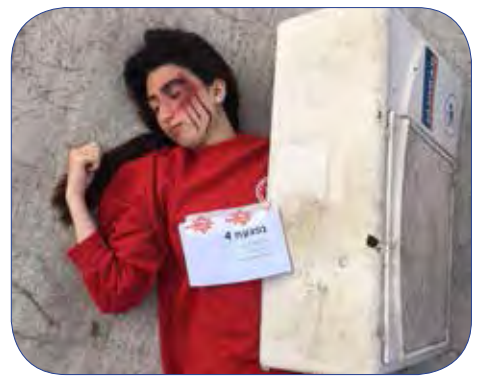
MDA Youth Preparing for an Earthquake