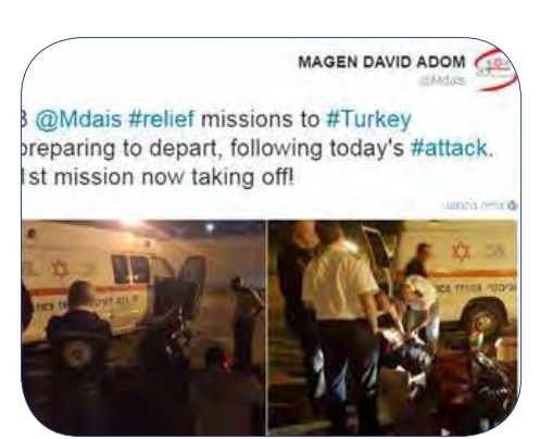
Is Twitter an Effective Tool for MDA Activities Overseas?