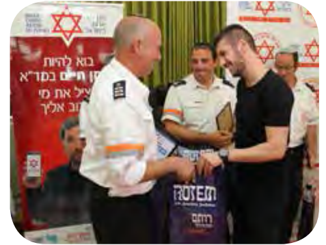
A Tearful Meeting on Good Deeds Day