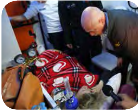
MDA Relief and Rescue Mission to Istanbul