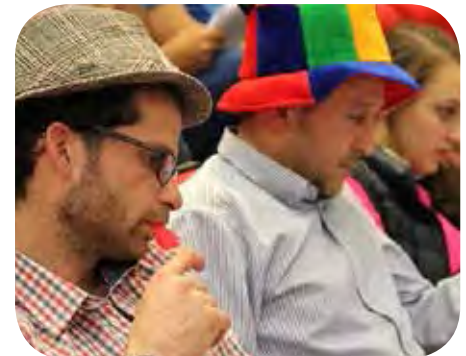
MDA Jerusalem Region Celebrates the Festival of Purim!