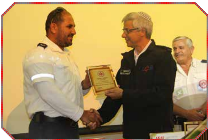
certificates of appreciation distribution