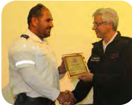
Special Evening Held to Honor Negev MDA First Responders