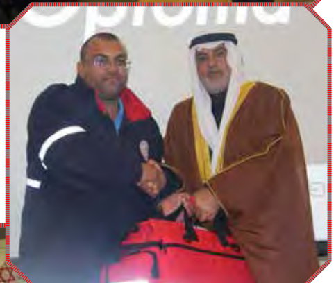
Protocols folders distribution